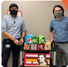
Long Point Baptist | Landrum MS