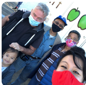
Mosaic Community Covenant | Ridgeway ES

"With the help of Loving Houston, we have been able to 'Love Landrum' through monthly goodie bags and even had the opportunity to love on them during the beginning of the pandemic with weekly challenges for gift cards. But the love has not stopped there, as Landrum Middle has returned our love for them. During the Christmas holidays, the choir was able to perform during one of our services, and they have helped us volunteer at many of our community events. Lastly, this relationship with Landrum has allowed us to pour into the students and their families. We have had two different families join our church because of our constant involvement at Landrum. All of these things are just a small sample of what we have been able to do at Landrum. And the truth is, none of this would be possible if we did not have the continual support of Loving Houston. My hope is that in time, every school in the Houston area will be partnered with a church body as we all continue Loving Houston."