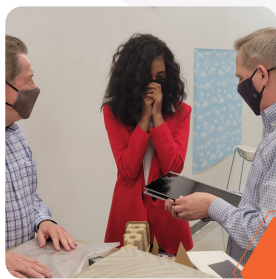
St Philip Presbyterian | Liberty HS